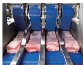
【Material input side】 Firmly holds by upper and lower meat feed. Slices are made with precise thickness.