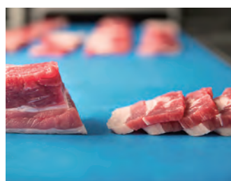
Pendulum-Type Diagonal Cutting image