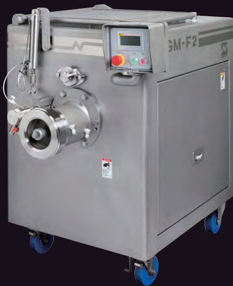
FROZEN CHOPPER GM-F2