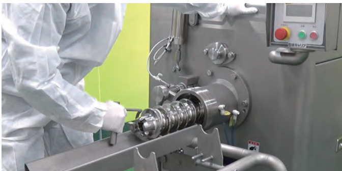
Top left: Bridge-breaking paddles Top right: Jacketed cylinder Bottom: Meat-feeding/discharge screw