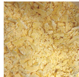
Butter cut into flakes