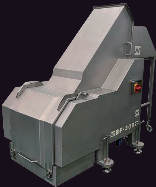
BUTTER FLAKER BF-300