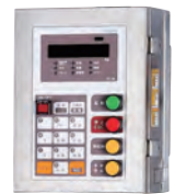
KUBOTA weight display (FC-W)